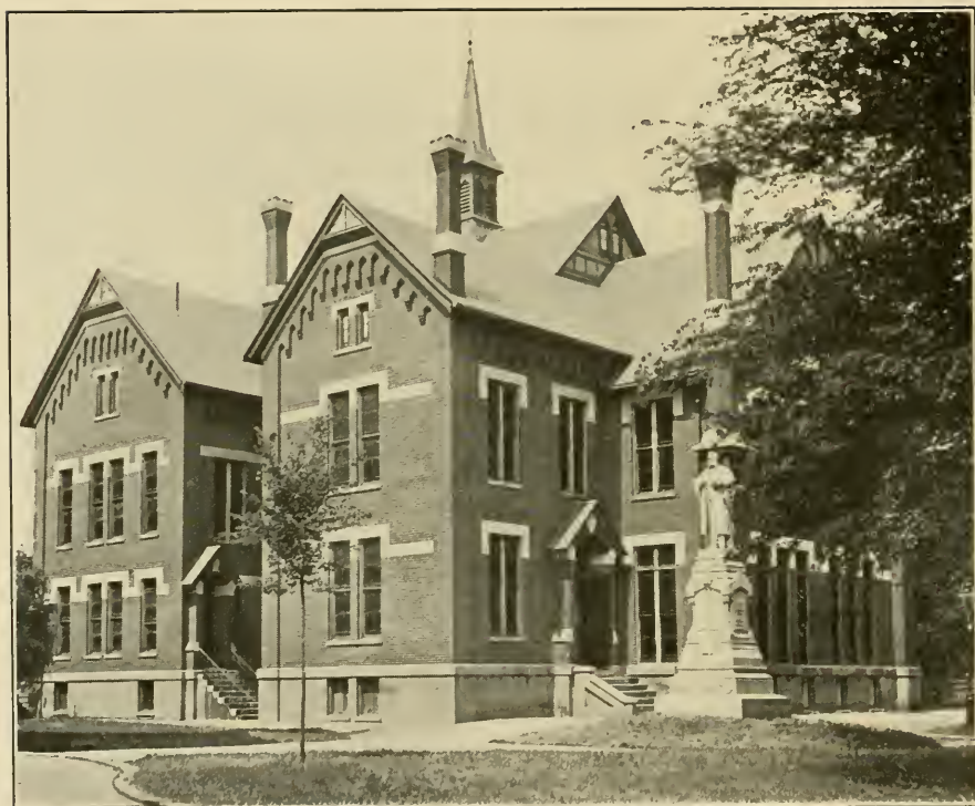
THE SUNDAY SCHOOL AND LIBRARY BUILDING.